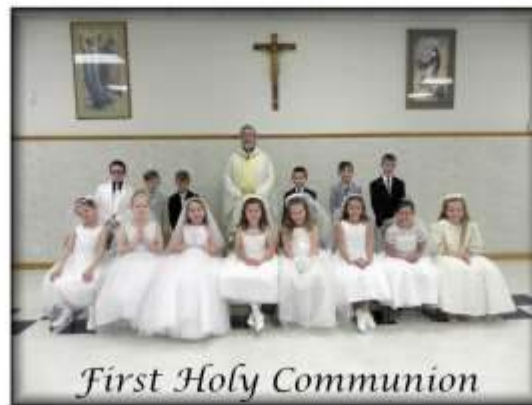
First Holy Communion